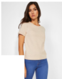
VEZA WOMAN CA6563