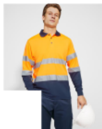
POLARIS L/S HV9306