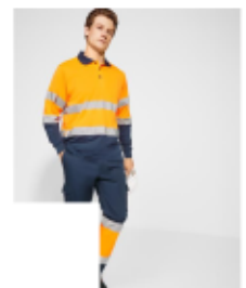
DALY STRETCH HV HV9312