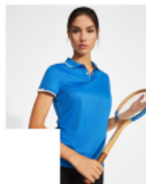
TAMIL WOMAN PO0409