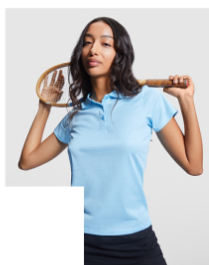
MONZHA WOMAN PO0410