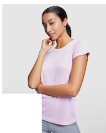
MONTECARLO WOMAN CA0423