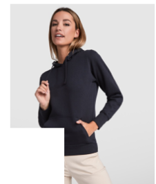
URBAN WOMAN SU1068