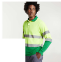
POLARIS L/S HV9306