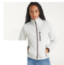
ANTARTIDA WOMAN SS6433