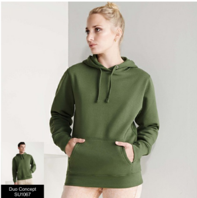
Duo Concept SU1067